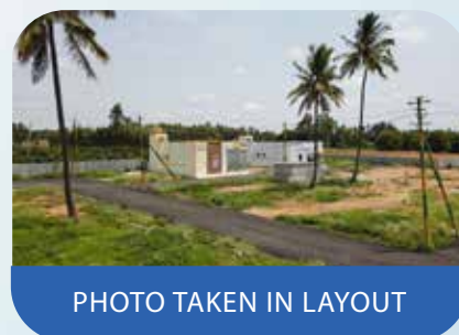
PHOTO TAKEN IN LAYOUT