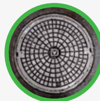
Under Ground Drainage