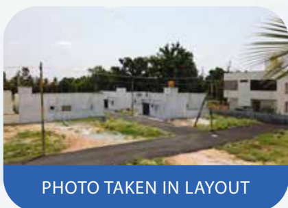
PHOTO TAKEN IN LAYOUT